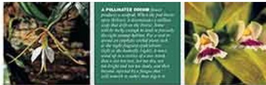
A POLLINATOR DOOR The cigar orchid has a unique flower structure that allows it to be pollinated by a specific species of bee. The plant is a shrub or small tree. It has yellow and red flowers. The plant is a shrub or small tree. It has yellow and red flowers.