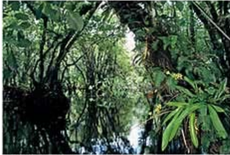
THICK BRANCHES overhang the deepest swamps in the Florida Panther National Wildlife Refuge, often harbor rare orchids, such as the giant (previous page), show shell (right) and yellow bellied (above, on the tree at right). Of the 20,000 acres of swampy areas of an orchid forest in core habitats, Florida has 150 percent or roughly half of its orchid in the United States and Florida.

To help restore the swampy habitat, the refuge's orchid poachers, more than 100 local species,